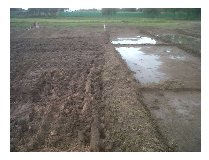
Figure 1. Expansive soils hydration by means of the "presaturation" method