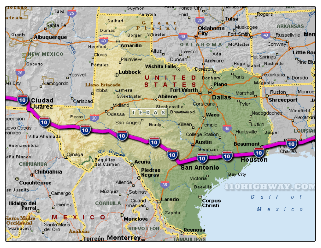
Figure 5. Interstate 10 Highway in the state of Texas (10highway)