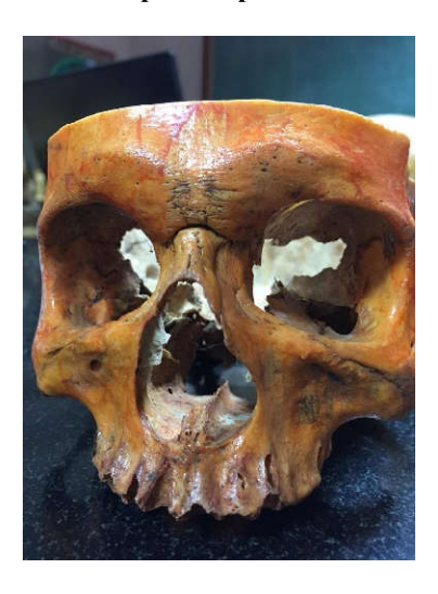
Linear metopic suture