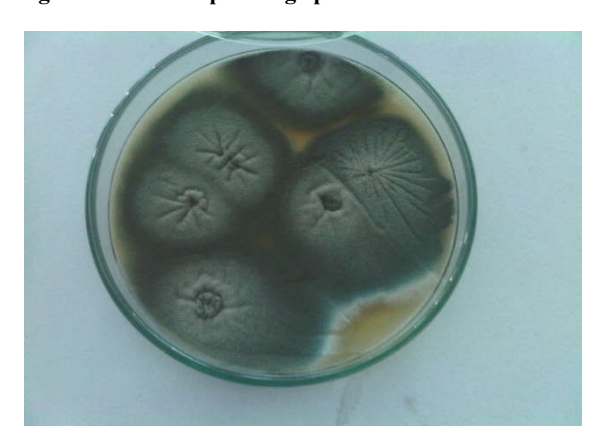
Figure 4. Culture of ass right