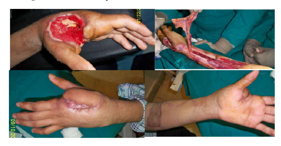
Figure 5. (Above) tissue loss in the dorsum of first web space with tendon exposure- RRFF elevation.(below) postoperative results