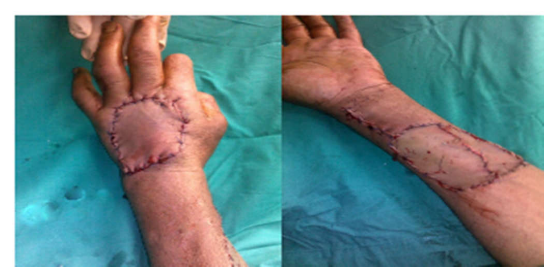
Fig. 3(A) RRFF covering the defect (B) SSG for donor sit closure

The upper limb is elevated to drain blood by help of gravity, and the tourniquet is inflated. The incision started at the proximal radial aspect of the flap over the radial artery and continued down to the deep fascia.