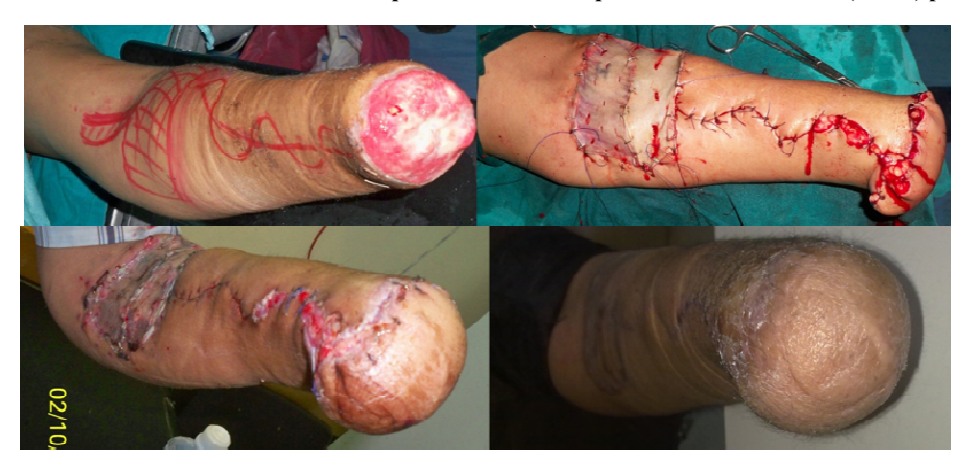
Figure 6. (Above) post amputee hand stump with raw area -RRFF elevation (below) postoperative results

But we didn't report any complete flap loss, tendon reexposure, gangrene, infection or septicemia. All Complications were managed conservatively by the local oily base ointment, wide approximating secondary sutures, control of general condition, and debridement when indicated. All donor sites were complicated by maceration of skin graft edges, but no infections, and also managed conservatively. We had achieved, complete wound healing and near normal hand function, or functional stumps which have good skin quality and it had been suitable for further prosthesis, and we got accepted aesthetic results. Figures 5, 6.