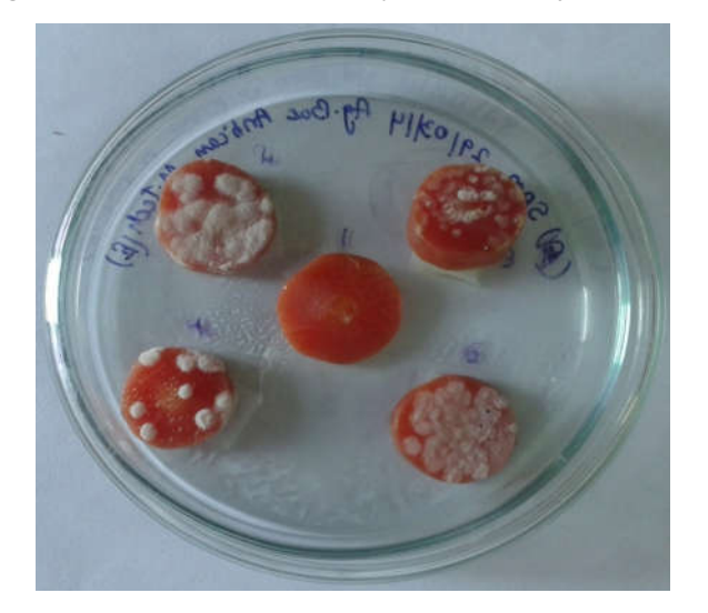
Fig.3. Anti-tumor Activity of Elettariacardamomumon Carrot-disc Assay with A.tumefaciens

(1) without any treatment (2) A. tumefaciens+ Elettariacardamomum extract (50 ppm*) (3) A. tumefaciens+ Elettariacardamomum extract (100 ppm*) (4) (+)ve control ( A. tumefaciens+ 70%EtOH) (5) (-)ve control ( A. tumefaciens )