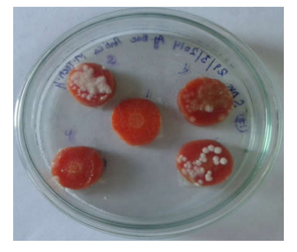
Fig.4. Anti-tumor Activity of Ferula assa-foetidaon Carrot-disc Assay with A.tumefaciens

(1) without any treatment (2) A. tumefaciens+ Elettariacardamomum extract (50 ppm*) (3) A. tumefaciens+ Elettariacardamomum extract (100 ppm*) (4) (+)ve control ( A. tumefaciens+ 70%EtOH) (5) (-)ve control ( A. tumefaciens )