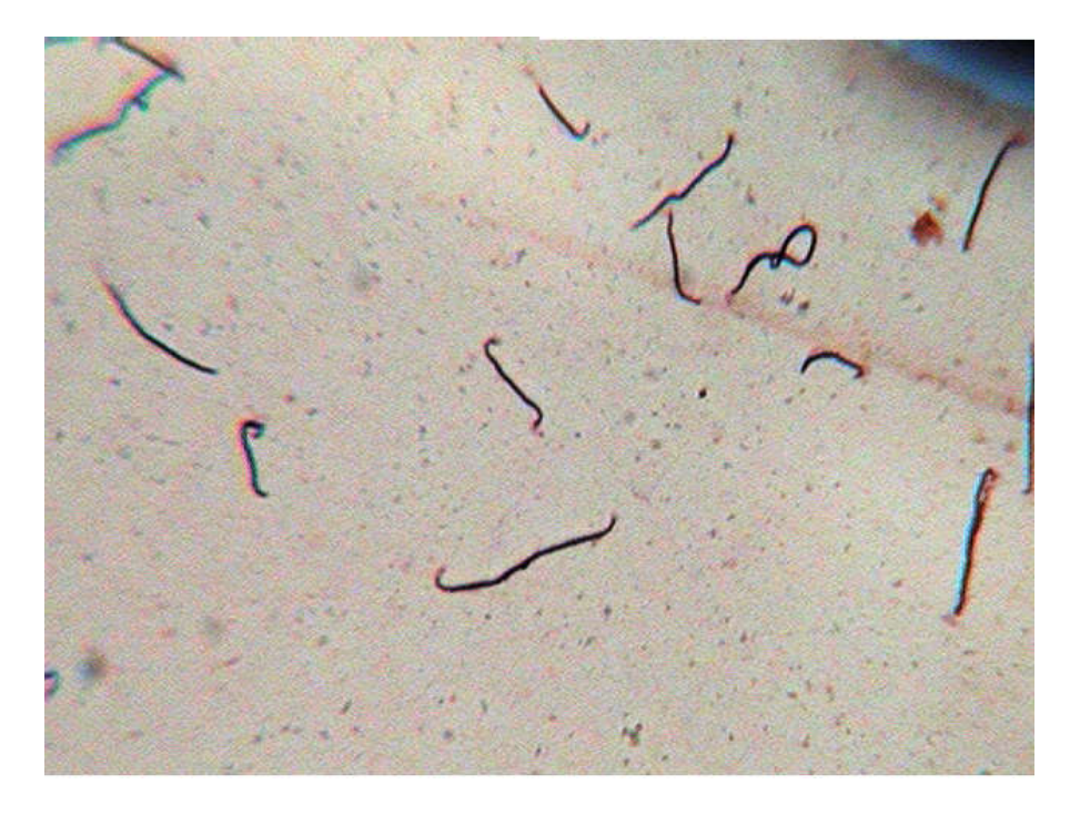
Fig. 1. Fontana's staining of Leptonema – S1