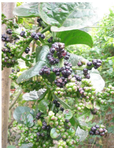
Fig. 3. The plant Basella alba Linn. var. rubra Linn. with dye yielding parts fruit (Berries).

The dye is extensively used in the dairy industry for colouring butter, ghee, cchees, margarins, icecream, chocolate, meat, cereals, confectionery, spices etc. The dye also used as an ingredient in hair oils, shoe polishes, nail gloss, furniture, soap, cosmetics, pharmaceuticals and ointments. The crude methanolic extract of this dye shows antimicrobial activity and grteast zone of inhibition was observed 7 mm against Vibrio cholerae and 4 mm in case of the remaining three strains. Medicinally the Fruits used as an astringent and purgative. Seeds used as an astringent, febrifuge, remedy for gonorrhoea. Carthamus tinctorius L. common name Safflower of the family asteraceae, a slender, much-branched, annual herb. Leaves alternate, oblong or oblong-lanceolate, lower shortly spinulose-serrate, upper with semi-amplexicaul base. Heads 2-3cm across, orange yellow, surrounded by a cluster of leafy bracts. Green, spinous or not; inner ones ovate-oblong, acute,