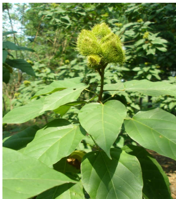
Fig. 5. The plant Bixa orellana Linn. with dye yielding parts fruit seeds.

spine-tipped. Flowers orange- red, yellow, some times white. Corolla segments linear. Anthers with sagittate base. Fruits 4- angled, obovoid achenes. Pappus absent. Safflower occupied a central position so far as development of various other derivatives from it is concerned and it is provided a major basis to the trade in natural colours in Bihar in the later of the 19 th century (Grierson, 1885). Safflower florets contain principally two colouring matters, carthamin which is scarlet-red and safflower yellow which is soluble in water. The dye used for colouring butter, liqueurs, candles and cloth; also employed in cosmetic industry in the production of rouge. The crude methanolic extract of this dye showing the antimicrobial properties and measured the inhibition range from 4 to 6 mm. Medicinally the flower used as laxative, sedative, stimulant, hot infusion also useful in cold infusion. Terminalia arjuna (Roxb.)