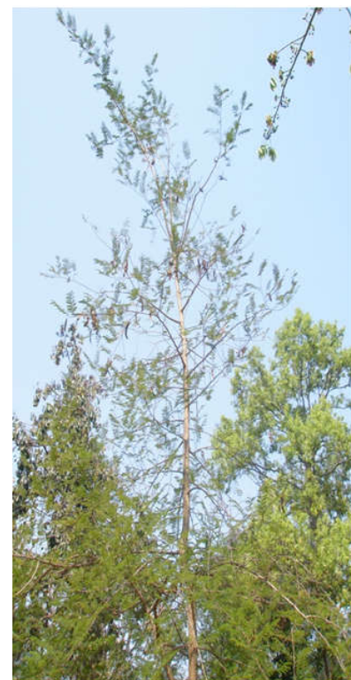
Fig. 2. The plant Acacia catechu (L.f) Willd.

Acacia catechu (L.f) Willd. A moderate sized tree. Bark dark grayish-brown, nearly 1.3cm in thickness, exfoliating in long narrow strips. Sapwood yellowish white but heartwood red. To boiling the heartwood chips in water and cooling the liquid of certain consistency obtained cutch that is the most important dye product which yields reddish brown colour. Cutch obtained from the heart wood is used in medicine as an astringent. Katha obtained from heartwood is commonly used for chewing with pan ( Piper betle L.) and it is also used as digestive. This plant showed the second anti microbial activity, inhibition ranging from 8 to 11 remaining all the seven dye yielding plant. Basella alba Linn. var. rubra Linn. Common name Poi, it is Winding or creeping. Stems & petioles usually red or green. Leaves broadly ovate to oblong, green. Spikes simple; rachies thick; flowers at first close together, gradually more spaced; elliptic. Stamens 5, epipetalous included; Ovary 1-celled; ovule 1, basal; styles 3; stigmas linear. Pseudoberry depressed-globose, lobed, showing black, containing a viole/maroot juice. Sap from the ripe fruits yielding the maroon colour which is used for dyeing sweets, jallies, silk, cotton cloth and also used in paintain purposes like 'Patchitra'. The plant containing amino acid, vitamin, organic acid and bioflavonoides. A glycoprotein present in the leaves which shown strong antiviral activity (Anonymous, 1988).