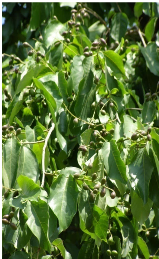
Fig. 8. The plant Terminalia chebula Retz with dye yielding parts fruit.

methanol extract for providing the antimutagenic effect and preventing the oxidative damage (Edenharder and Grunhage, 2003). The whole antimutagenicity assay it was recorded that the lowest percent of inhibition 20.2% in TA 98 strain and 25.1% in TA 100 strain in Beta vulgaris Linn. of the 25 µg/plate. Antimutagenic potential of a fraction isolated from Terminalia arjuna has been evaluated in TA 98 and TA 100 strains of Salmonella typhimurium against direct and indirect acting mutagens. The fraction was quite effective against S9-dependent 2AF while it showed moderate effect against NPD. The fraction was analyzed to be ellagic acid (Kaur et al. , 1997).