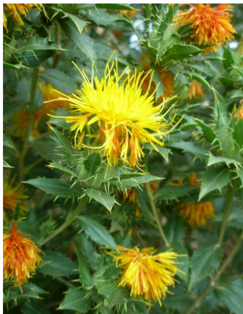
Fig. 6. The plant Carthamus tinctorius L. with dye yielding parts flower.

Wight. & Arn, a medium to large size tree; bark smooth, flaky; branches spreading or inclined. Leaves alternate or sub-opposite, oblong or elliptic-oblong, flowers whitish-greenish, in terminal and axillary paniced spikes; calyx glabrous, 3.5-4 mm long, lobes triangular; petals absent; stamens much exserted; ovary covered with crisped hairs. Fruits 5-angled, 5-winged, marked with ascending striations, glabrous, ovoid or obovoid-oblong. Stem bark of this plant present arjunolic acids, tomentosic acid, ellagic acid, arjungenin tannins containing catechin, galocatechin, epicatechin (Rastogi and Mehrotra 1993a,b,c). The stem bark yield the magenta colour which is used for colouring silk and cotton cloth. The plant also have medicinal properties. Decoction of the bark used for washing ulcers.; decoction of fresh bark is prescribed in palpitation, low blood pressure, blood dysentery; bark pounded in water over night and the water is given to treat haematemesis, , menorrhagia leucorrhoea (Padmaa, 2010). In the study of antimicrobial properties, it shows the positive response and inhibition ranging from 5 to 7 mm against the entire supplied microorganism. Strong antibacterial activity shown by the methanol extracts of this plant against multi-drug resistant Salmonella typhi (Rani and Khullar, 2004).