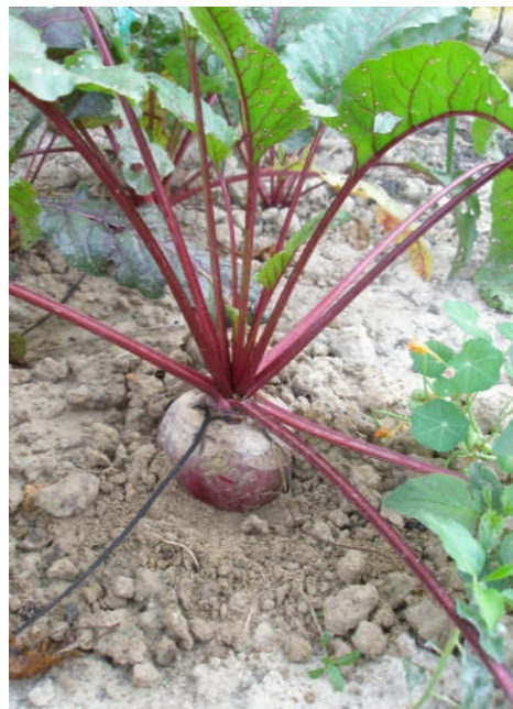
Fig. 4. The plant Beta vulgaris Linn with dye yielding parts root.

The dye is extensively used in the dairy industry for colouring butter, ghee, cchees, margarins, icecream, chocolate, meat, cereals, confectionery, spices etc. The dye also used as an ingredient in hair oils, shoe polishes, nail gloss, furniture, soap, cosmetics, pharmaceuticals and ointments. The crude methanolic extract of this dye shows antimicrobial activity and grteast zone of inhibition was observed 7 mm against Vibrio cholerae and 4 mm in case of the remaining three strains. Medicinally the Fruits used as an astringent and purgative. Seeds used as an astringent, febrifuge, remedy for gonorrhoea. Carthamus tinctorius L. common name Safflower of the family asteraceae, a slender, much-branched, annual herb. Leaves alternate, oblong or oblong-lanceolate, lower shortly spinulose-serrate, upper with semi-amplexicaul base. Heads 2-3cm across, orange yellow, surrounded by a cluster of leafy bracts. Green, spinous or not; inner ones ovate-oblong, acute,