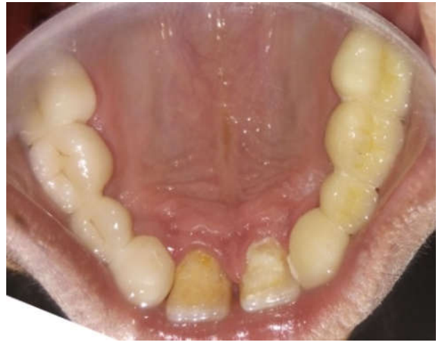
Fig.8. Cementation of upper FPDs