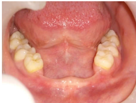
Fig.3. Intraoral view- mandibular arch