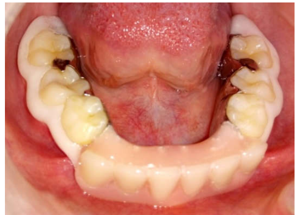
Fig.9. Try in of CPD framework with Wrap around acetyl resin design Fig.10. CPD With modified swing lock Attachment inserted

Orthopantomograph and cone beam computed tomography reveals agenesia of alveolar bone in region of missing teeth (Fig. 5,6). Different treatment options like Osseointegrated implant supported prosthesis and conventional fixed prosthesis using a variety of materials were considered. After a thorough evaluation and discussion with patient, a conventional fixed all-ceramic prosthesis in maxillary arch while cast partial denture with modified swing lock attachment in mandibular arch was planned. In maxillary arch tooth preparation was carried out with 13, 55, 16 and 23,65,26. Following gingival retraction, impression procedures and temporisation procedure; monolithic variant of zirconia ceramic fixed partial dentures were cemented (Fig.7,8). In mandibular arch, after surveying and mouth preparation procedures; it was decided to fabricate cast partial denture with modified swing lock attachment due to inadequate tissue support from edentulous region and absence of any appreciable desired undercuts. Buccal portion of remaining teeth viz 75,36,37,85,46,47 were encircled with aesthetic arm of acetyl resin polymer (Fig.9,10). Necessary occlusion correction done following insertion of cast partial denture. Follow up was done after 24 hrs, one week, 3 months, 6 months.