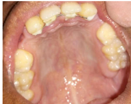
Fig.2. Intra oral view- maxillary arch