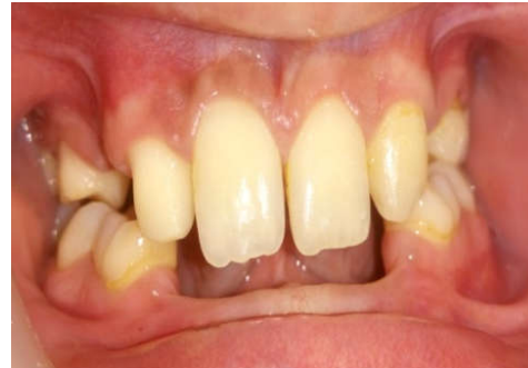
Fig.4. Intra oral view in occlusion