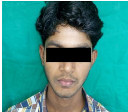
Fig.1. Preoperative facial