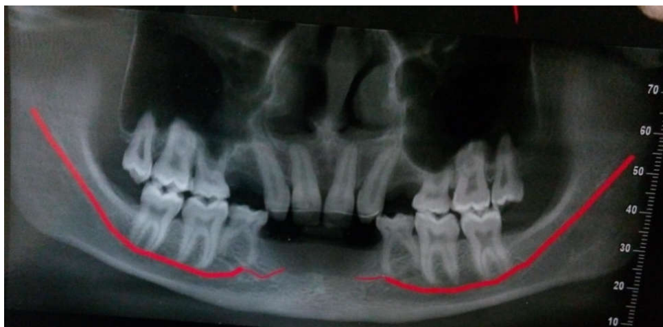
Fig. 6. OPG of patient