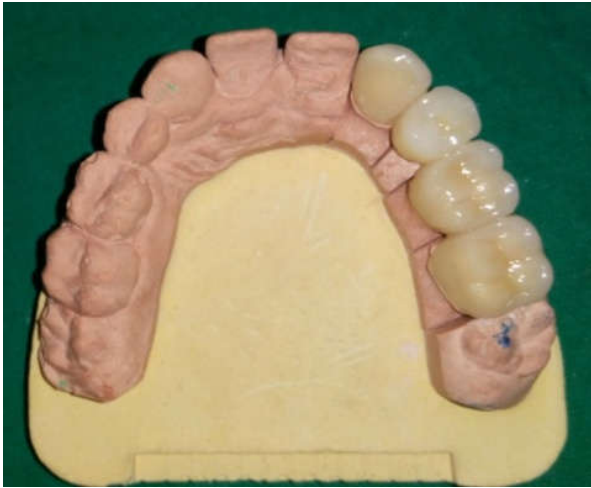
Fig. 7. Monolithic zirconium FPD