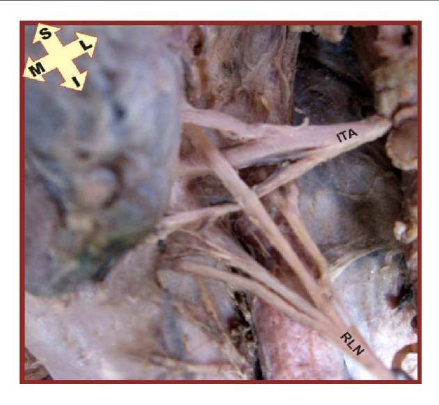
Fig. 3. Illustration showing RLN between the branches of ITA RLN - Recurrent Laryngeal Nerve ITA – Inferior Thyroid Artery