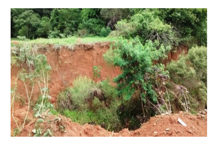
Figure 1. Gully Geovane Braga