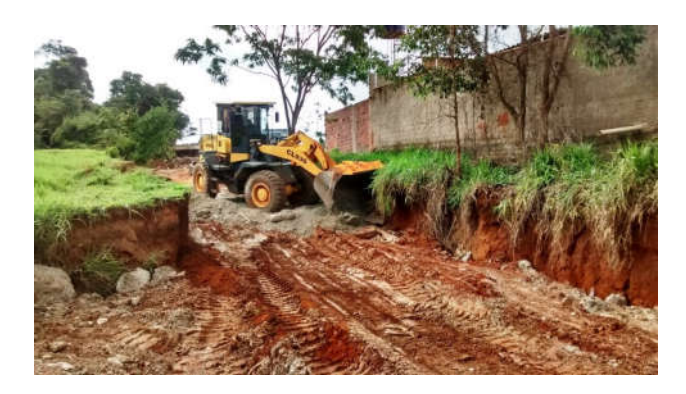
Figure 6. Reshaping the gully

.pH in H2O, ratio 1: 2.5, Terra Fina Dry Air (TFSA): H2O