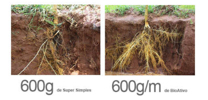
Figure 8. Difference in the plant receiving the phosphor.

For the recovery of soil fertility were used organophosphate fertilizers, and implementation of Braquiária as vegetation