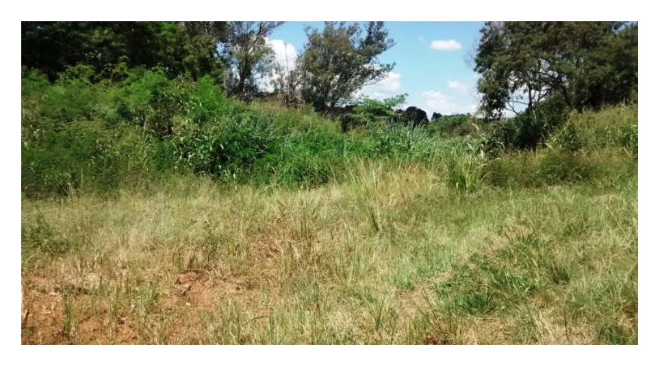
Figure 10. Area recovered from the gully