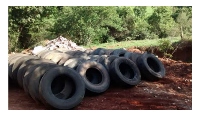
Figure 3. Tires used in the gully

The area was eroded isolated with wire fencing for animals, machines and people not operated on her or in neighboring areas (especially upstream). Agricultural activities in the surrounding area were interrupted by step degradation on site. firebreaks were built around the fences to protect the implanted vegetation of possible fires. The level of soil degradation was defined by determining the thickness of the surface horizon and for comparison with other soil profiles from nearby areas that have the same characteristics as assessed but which are still with vegetation. According to information contained in the IBGE Pedologia Technical Manual of the area degraded by erosion in question was in eroded phase, which has extremely strong erosion of class, ie, the soil is very deep grooves (gully) (IBGE, 2016). The area was divided into sub-areas with homogeneous characteristics, considering the natural drainage system, the stage of erosive processes, differences in color and texture of the soil, positioning relief, the vegetation in the area and history of use.