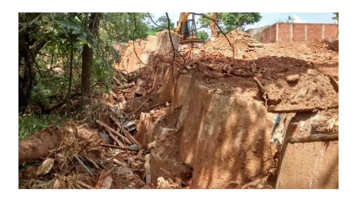
Figure 4. Palisade of water and sewage shackles installed in gullies

For this was used machines, because of the extent and the bank or slope height. This work was carried out during the dry season in order to have the entire area prepared to receive planting at the beginning of the rainy season. After performing the mechanical practices such as the construction of palisades and the reshaping of slopes and ravines, were applied plant remains for the formation of mulch on the surface eroded until the herbaceous species, shrubs and trees planted to establish and guarantee good protecting the soil.