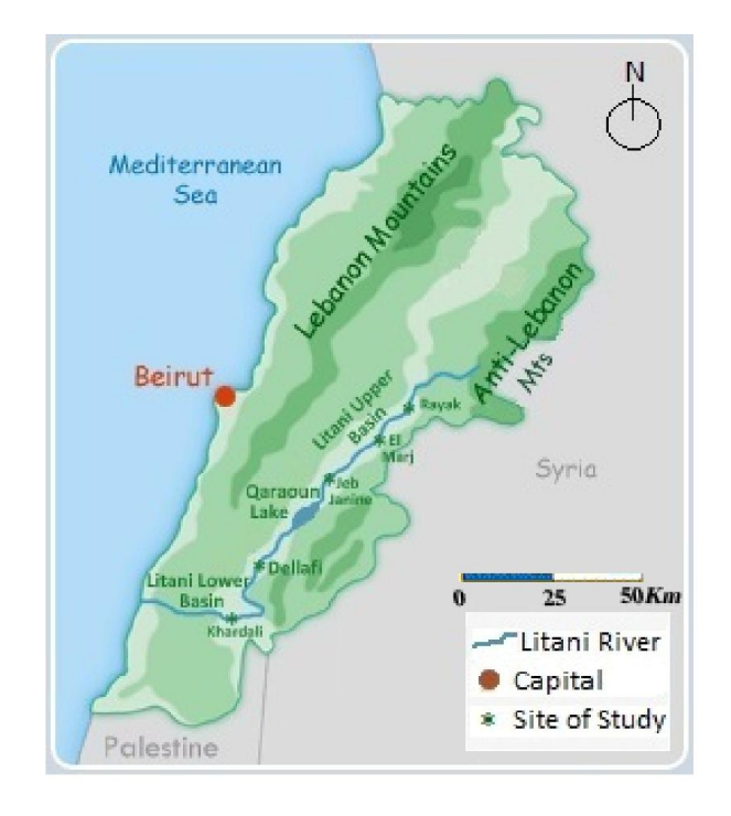
Figure 1. Study sites at Upper and Lower Litani River Basins, Lebanon. Source Baydoun et al. (2016) adopted of https://strikehold.files.wordpress.com/2009/10/bekaa-valley-map.gif

Situated within the boundaries of Lebanon, Litani River runs for about 170 km through Bekaa Valley in a south- westerly direction to meet the Mediterranean Sea (Figure 1).