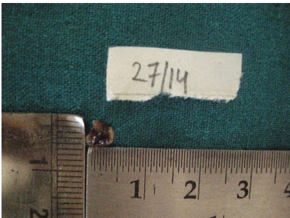
Figure 2. Biopsy Specimen