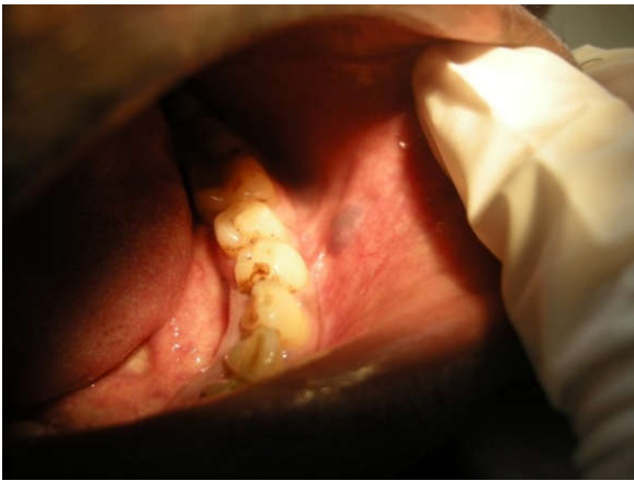
Figure 1. Clinical Presentation of the cyst

Soft tissue examination showed generalised reddish pink gingiva, generalised bleeding on probing. Inspection of lesion showed a solitary, well defined swelling in the lower left buccal vestibule, roughly round measuring around 0.5x0.5cm in size, extending from the distal aspect of 34 to mesial aspect of 35. Surface of the swelling appeared stretched, shiny. Colour was bluish translucent. Surface was intact. No signs of any discharge, bleeding. No visible pulsations. (Figure 1) Palpation of the swelling confirmed all inspectory findings. It was uniformly soft in consistency, non-tender, fluctuant, compressible, non-reducible, non-pulsatile and non-blanching on pressure.