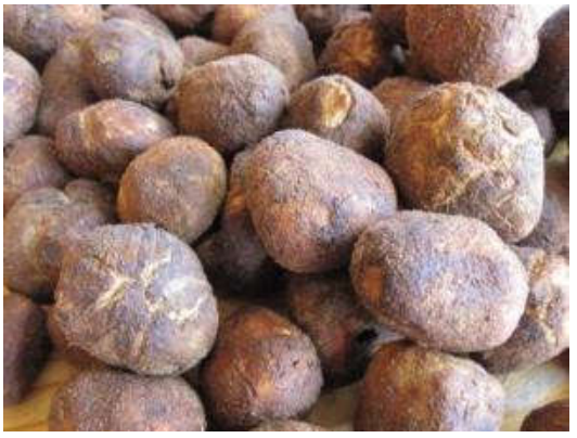
Plate 2: Namibian Kalahari truffle gastronamibia (wordpress.com, 2012)