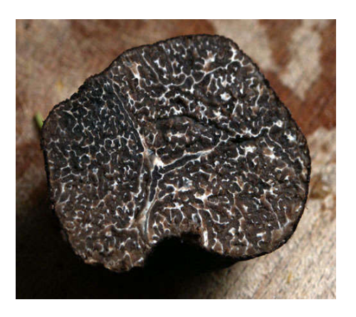
Plate 1: