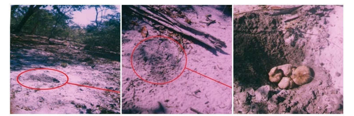
Plate 3. Miombo Kalahari soils in Zambian and the Zambian truffle