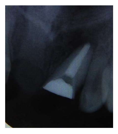
Fig. 2. After 6 month

relieving incisions from right lateral incisor to left canine. On reflection it was seen that 0.5 to 0.8 mm cystic defect was present at the mesial surface of apical third of 21, suggestive of a lateral periodontal cyst. The area was thoroughly debrided and curettage done. Defect was filled with \beta -TCP bone graft (Septodont RTR cone®) and L-PRF membrane was placed over it. Flap was approximated with interrupted non-resorbable 4-0 silk suture and post-operative instructions were given. Patient was prescribed amoxicillin 500mg + clavulanic acid 125mg prophylactic antibiotic bid for 5 days and diclofenac sodium analgesic for 5 days. Patient was recalled after 1 week for suture removal and surgical healing was found to be satisfactory. Case was followed up at 6 (Fig.2) and 9 month (Fig.3) which showed adequate bone fill in intra oral periapical radiograph.