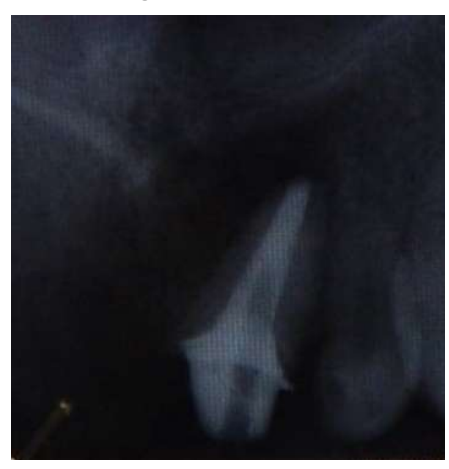
Fig. 3. After 9 month