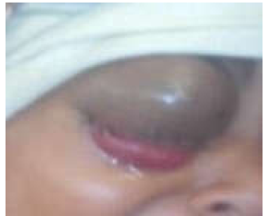
Figure 1. hemangioma involving right eye upper lid with Conjunctival Chemosis

does not subside and gradually increased in size. This leads to the patient quite pain. He had no other systemic symptoms and no any facial muscle weakness. Past medical and surgical histories were unremarkable. Patient denied any eyelid surgery, injectables, or ocular history. The patient was not on any medications. Family and social history were non-contributory. Birth history full term, normal vaginal delivery with birth weight 2.6 kg with no neonatal care unit admission no any other postnatal complications.